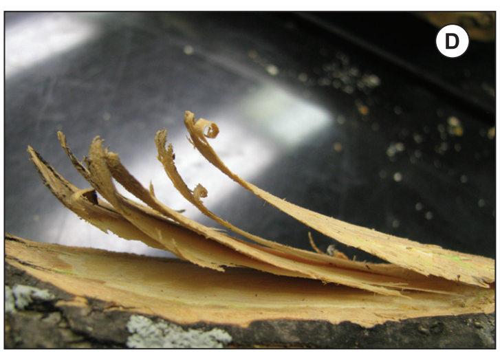
Fig. 3. Cutting (a), measuring and trimming (b) ash branches. Branches, cut to a length of 75 cm, are placed in a vise and bark is whittled off the basal 50 cm (c) (1.5 m piece shown here). Whittling removes bark in thin 1-2 mm strips (d).