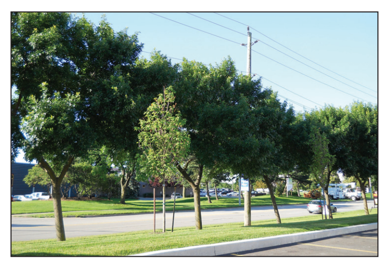
Fig. 2. Healthy-looking ash trees with no visible sign or symptom, but determined to be infested with EAB using branch sampling.

Ryall et al. (2010) sampled many ash trees with \underline{\mathbf{no}} obvious sign or symptom of EAB attack (Fig. 2) and showed that branch sampling was an effective method of detecting EAB-infested trees; indeed, 74% of the infested trees would have been discovered if the method described below had been used. The purpose of this note is to describe this basic sampling technique.