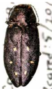
Figure 5b. Adult hemlock borer (Photo: Pennsylvania Department of Conservation and Natural Resources).

In mixed stands, tree species associated with hemlock become more abundant. These changes lead to an increase in species richness and abundance as dying hemlocks give way to a wider array of plants, fungi and animals. However, these changes also lead to a significant reduction in the flora and fauna associated with distinctive hemlock-dominated ecosystems.