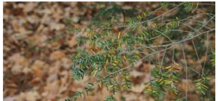
Figure 4a. Shoot dieback and chlorosis of older needles of eastern hemlock infested by the hemlock woolly adelgid.

The presence of white woolly masses on shoots on the underside of hemlock twigs is a clear sign that trees are infested by HWA (Fig. 3). Some of the symptoms of injury include abortion of buds, chlorosis (yellowing of foliage), needle loss and dieback of new shoots (Fig. 4a). Heavily infested hemlock trees will look greyish-green from a distance, with thinning crowns (Fig. 4b, 4c). Once significant dieback of shoots and needles occurs on the tree, the accompanying loss of tree vigour exerts a