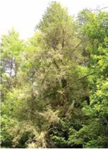
Figure 4b. Yellowish-grey-green colour of foliage of infested trees.