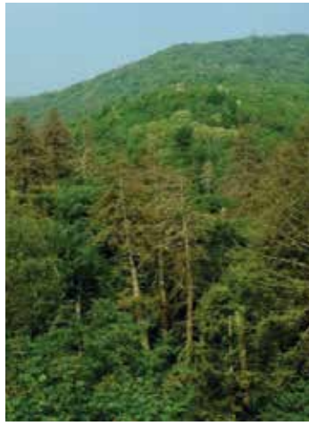
Figure 4c. Groups of infested trees with yellowish-grey-green coloured foliage.

negative influence on populations of HWA. Because survival of sistens nymphs is significantly higher on new shoots than older shoots, the decreasing number of new shoots to infest, due to bud abortion and dieback, causes the population of HWA to decline rapidly.