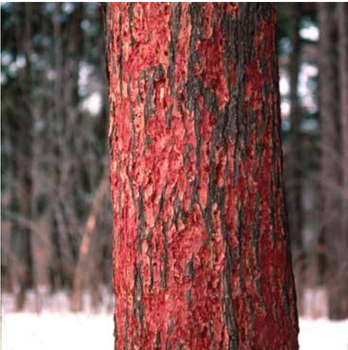
Figure 5a. Sign of the presence of the hemlock borer, Melanophila fulvoguttata (Harris), which can often attack hemlock trees stressed by the hemlock woolly adelgid, as revealed by foraging woodpeckers.

At this point, the severely stressed trees may succumb to secondary organisms, such as the hemlock borer, Melanophila fulvoguttata (Harris) (Fig. 5a, 5b) or root disease, Armillaria mellea (Vahl:Fr.) Kummer. If instead the tree begins to recover and produce new shoots, the HWA population will eventually rebound as well. Rebounding HWA populations often cause too much stress for recovering trees and lead to tree death. Observations in the U.S. indicate that HWA has resulted in greater than 90% mortality of infested hemlocks.