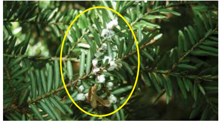
Figure 3. HWA sistens nymphs and eggs inside a white woolly mass along the main stem of infested shoots of eastern hemlock near Niagara Falls, Ontario, in 2013.

Sistens adults lay about 150 progrediens eggs inside their woolly ovisacs in late April to early May (Fig. 3). In May, progrediens crawlers hatch and settle at the base of a needle on the same shoots amongst their sistens mothers (e.g., on last year's new shoots). Progrediens nymphs take about a month to complete development. Progrediens adults lay about 25 sistens eggs inside their ovisacs (Fig. 3).